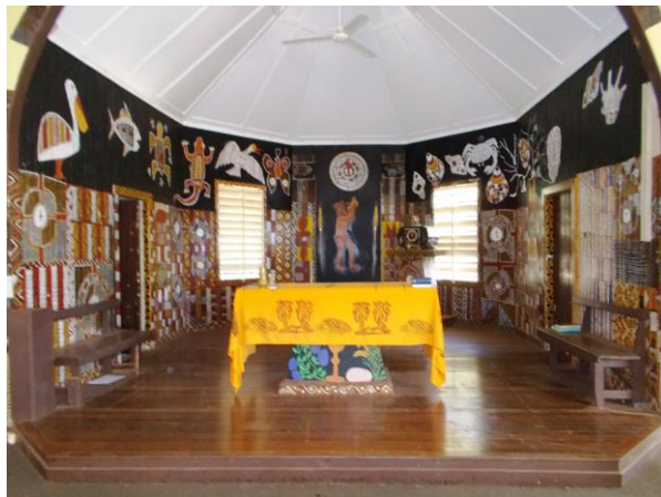
The church pulpit, Tiwi style