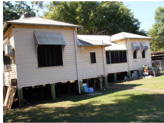
The old presbytery