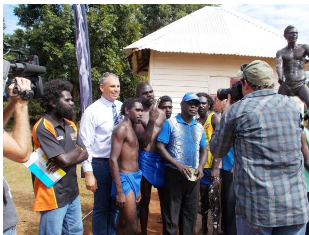
The Chief Minister with some of the Ulungura family