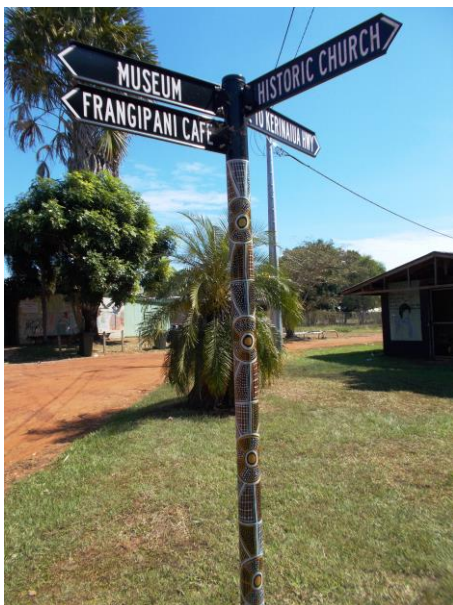
One of the many decorative poles