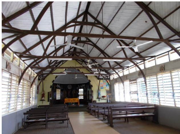
Inside the church