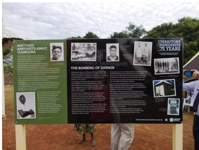
Newly erected sign by Territory Remembers