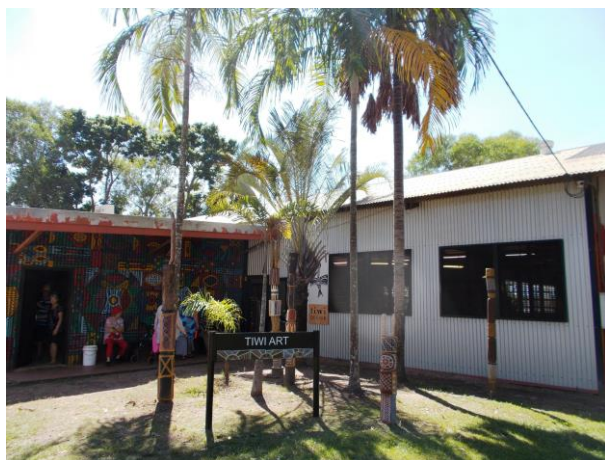
Entrance to the Tiwi Design shop