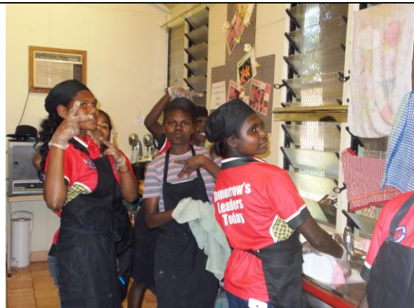
The girls working in the Frangipani Café