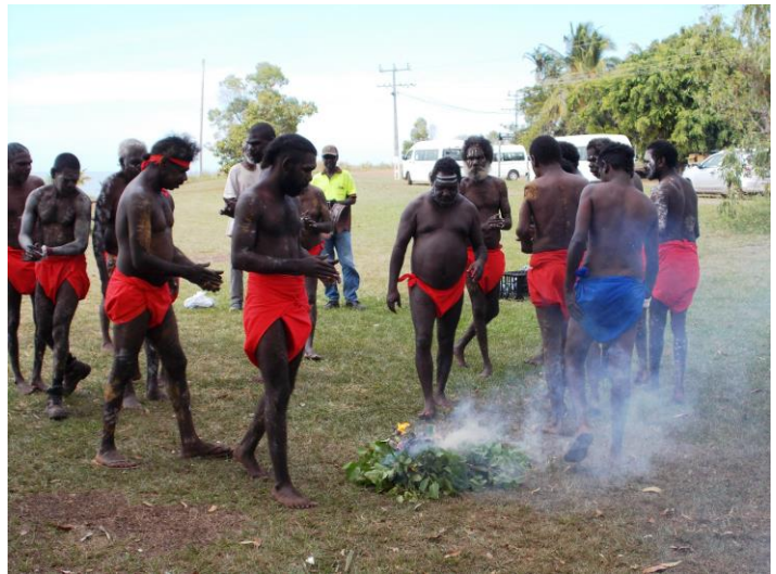
Welcomed with the smoke dance