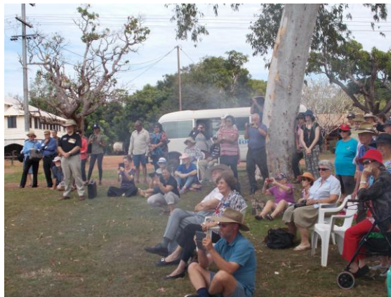
Audience watching the smoke dance