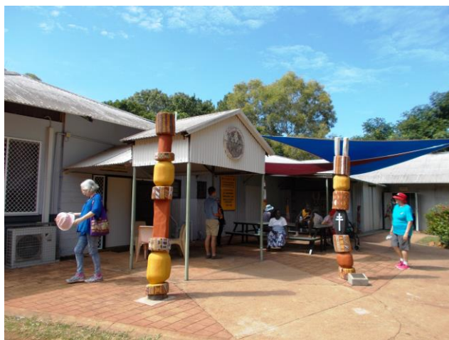
Entrance to the Patakijiyali Museum