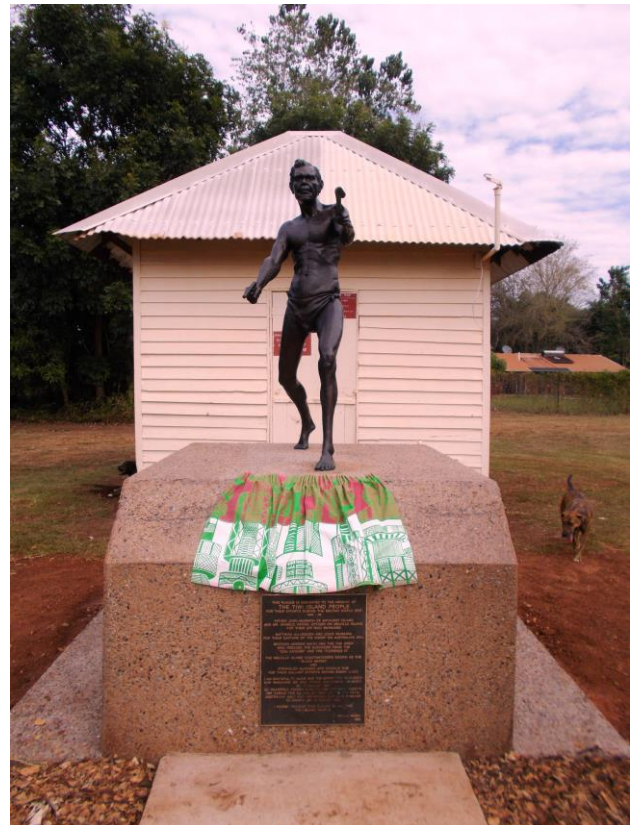
Statue of Matthias Ulungura

The rest of the day was spent visiting St Theresa Catholic Church, the museum, supermarket, shopping at the art and design shop, partaking of a much needed coffee and cake at the café and enjoying the delicious BBQ lunch the community put for us. Big thanks to the organisers for such a wonderful day.