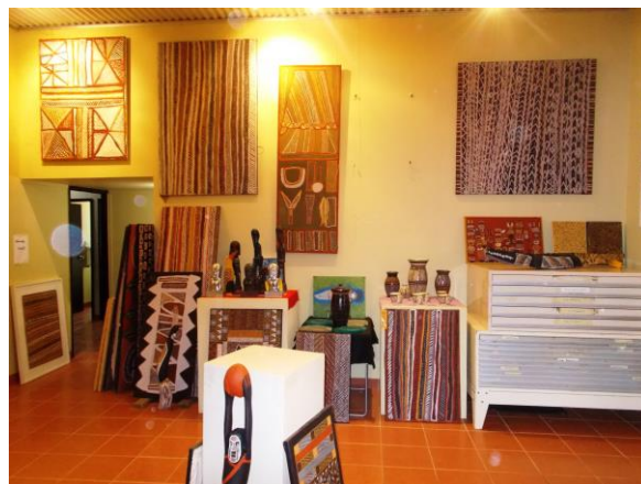
Inside the Tiwi Design shop