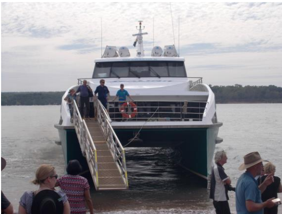
Our arrival via ferry