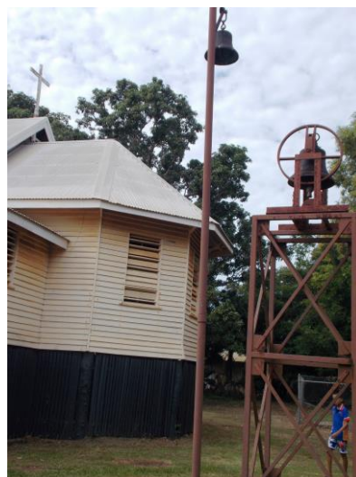
The rear of the St Therese Catholic church built in 1941